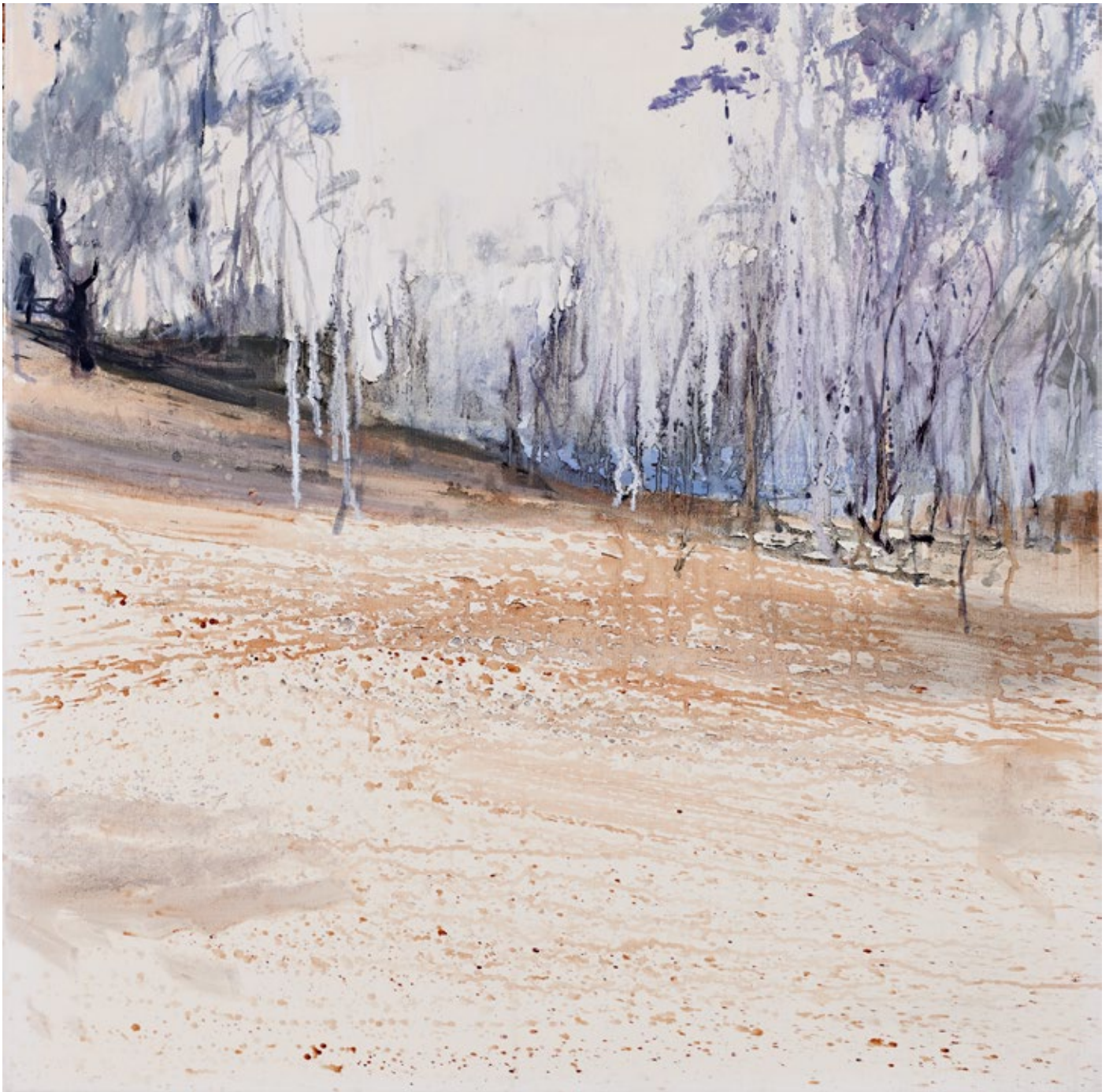
Rewind I oil on linen 61 x 61 cm