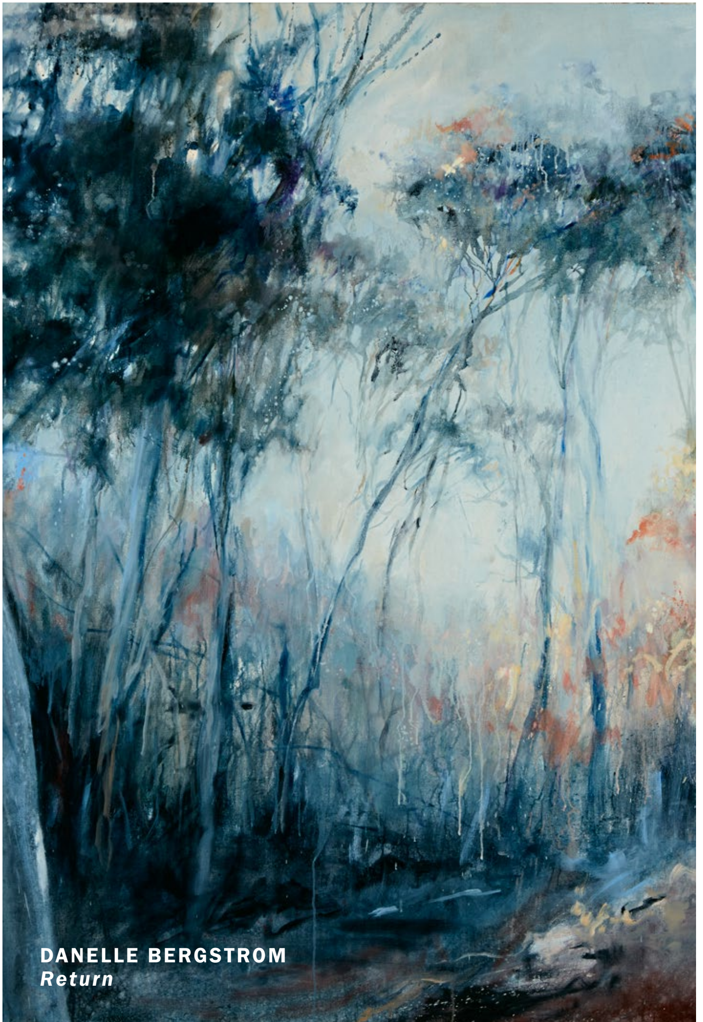
DANELLE BERGSTROM Return